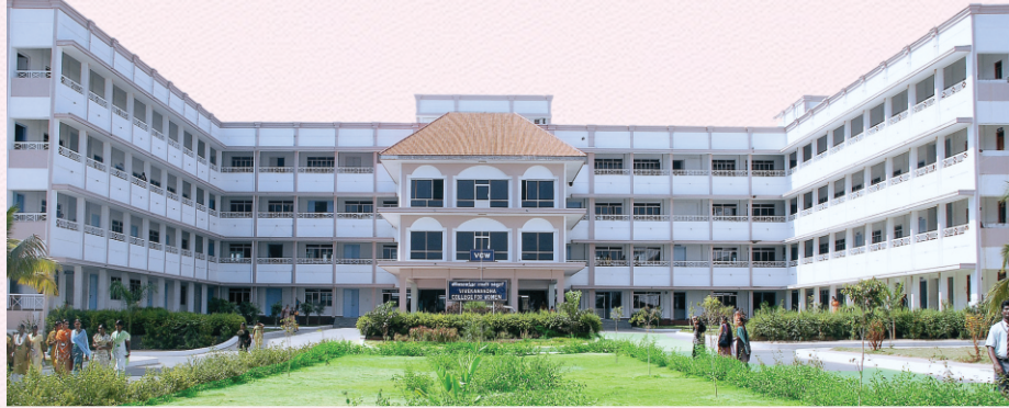
VIVEKANANDHA COLLEGE FOR WOMEN