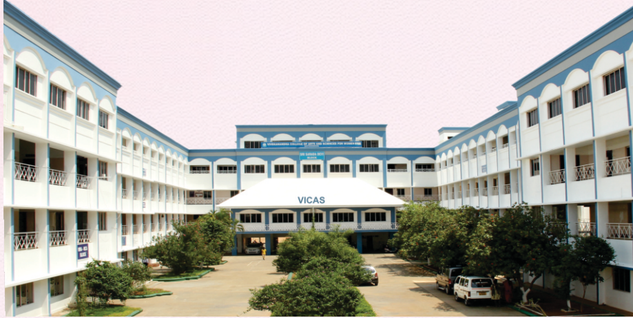
VIVEKANANDHA COLLEGE OF ARTS AND SCIENCES FOR WOMEN (Autonomous)

Tiruchengode - 637 205, Namakkal Dt., Tamil Nadu. Mobile : 94437 34670, 99655 34670, 94425 34564, 97888 54417 Website : www.vivekanandha.ac.in Email : vivekaadmission@gmail.com