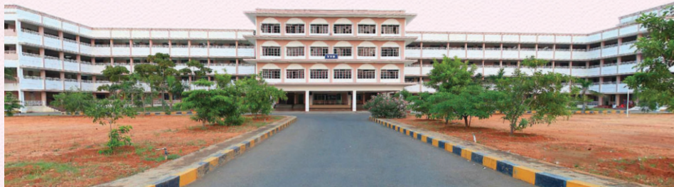
VIVEKANANDHA COLLEGE OF EDUCATION FOR WOMEN & KRISHNA COLLEGE OF EDUCATION FOR WOMEN